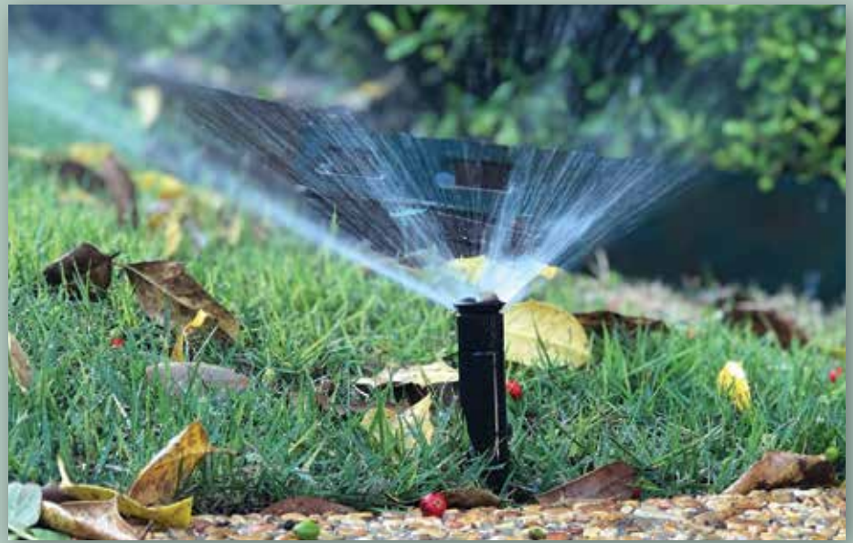
This year's report features images of water sprinklers from around the city of Florence, Alabama.