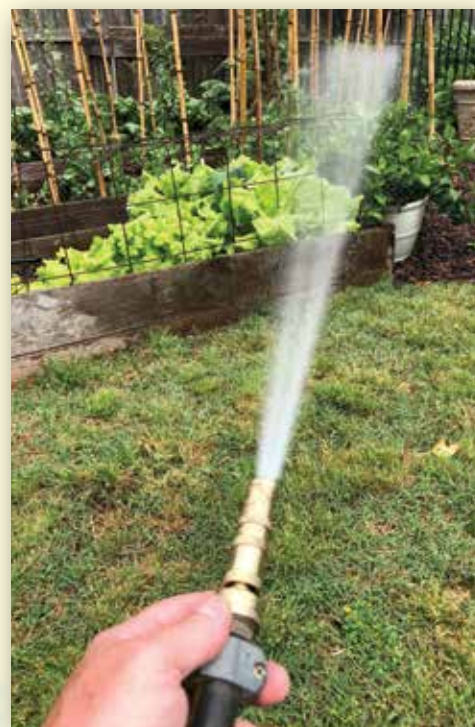
This year's report features images of brass nozzles.