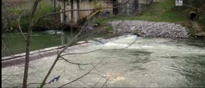
Before remediation: 3/19/11