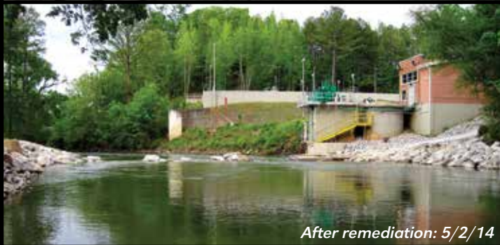
After remediation: 5/2/14