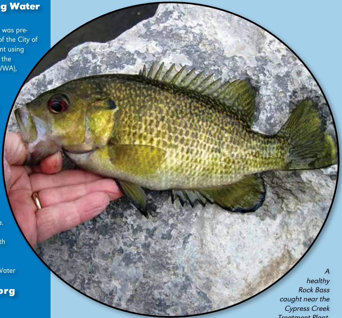
A healthy Rock Bass caught near the Cypress Creek Treatment Plant.